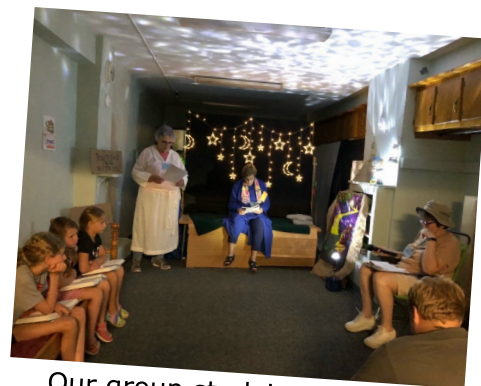
Our group studying the story of Jacob in the wilderness.