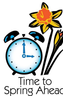
Time to Spring Ahead

SUNDAY, March 9 th Daylight Savings Time Begins